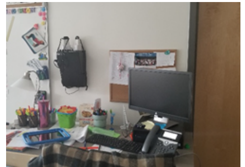
IR-800 classroom system